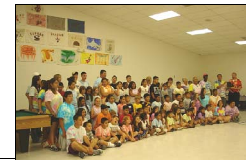
Artesia Recreation Center Summer Program 1 st Place Parade Winners

We would like to congratulate all of our winners and thank all of our sponsors, volunteers and participants for making this year's event a HUGE success for a small town!