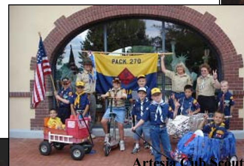
Artesia Cub Scouts 2 nd Place Parade Winners