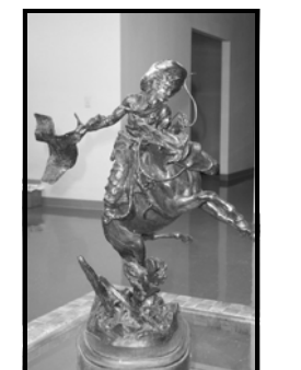
"Wild As Wyoming Wind" Bronze by Vic Payne

For Ticket information, please contact the Chamber @ 746-2744 or MainStreet @ 746-1117