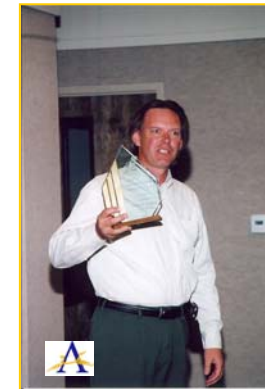
Artesia General Hospital, Chip Camp Corporation of the Year Award